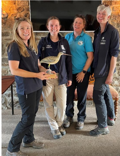
Figure 3 – the team learning about Curlews at a training event run by the Countryside Management Association.