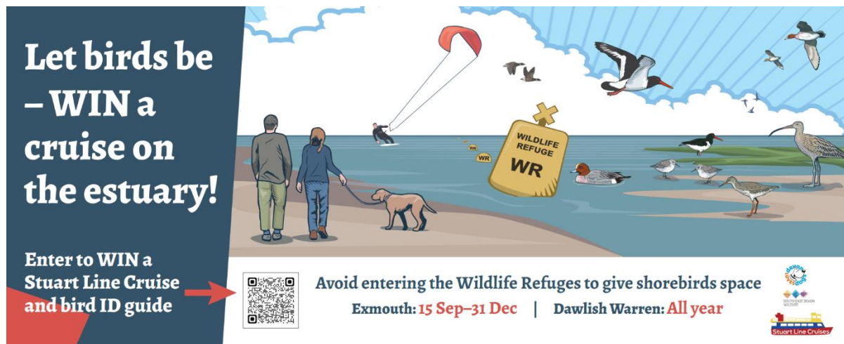
Figure 5: New Wildlife Refuge competition banners

3.6 Competition entry requires the answering of multiple-choice questions on the running dates of the Wildlife Refuge, species we expect to see in the Refuge and why it's so important to remain out of the Wildlife Refuges - to give overwintering wildlife the space to rest and feed undisturbed. Answering these questions, ensures competition entrants have knowledge of the Wildlife Refuge and why it exists.