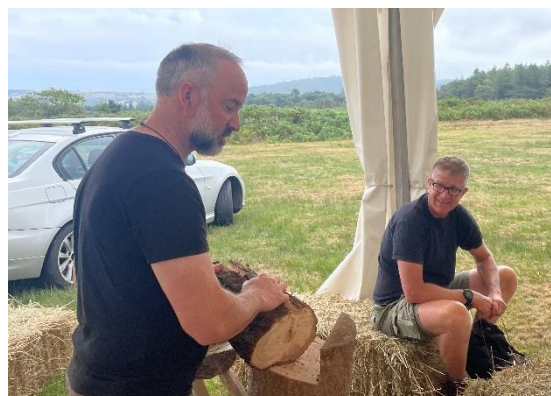
Figure 2: Heath week Crafter-noon.