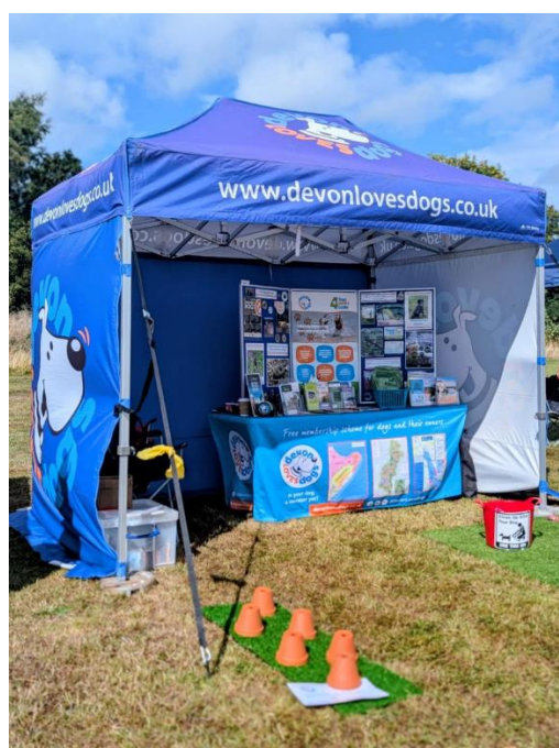
Figure 12: The DLD gazebo set-up for pitstops and events.

4.4 I've attended several events over the summer including Heath Week Festival Day where I teamed up with Dawn Spence from "Pawsitive Canine" to chat to people about Canicross. I spent a busy day making dog themed crafts at Bystock Discovery Day, both as part of Heath Week.