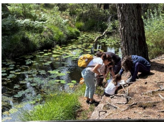
Figure 3: Pond dipping at Bystock Discovery Day