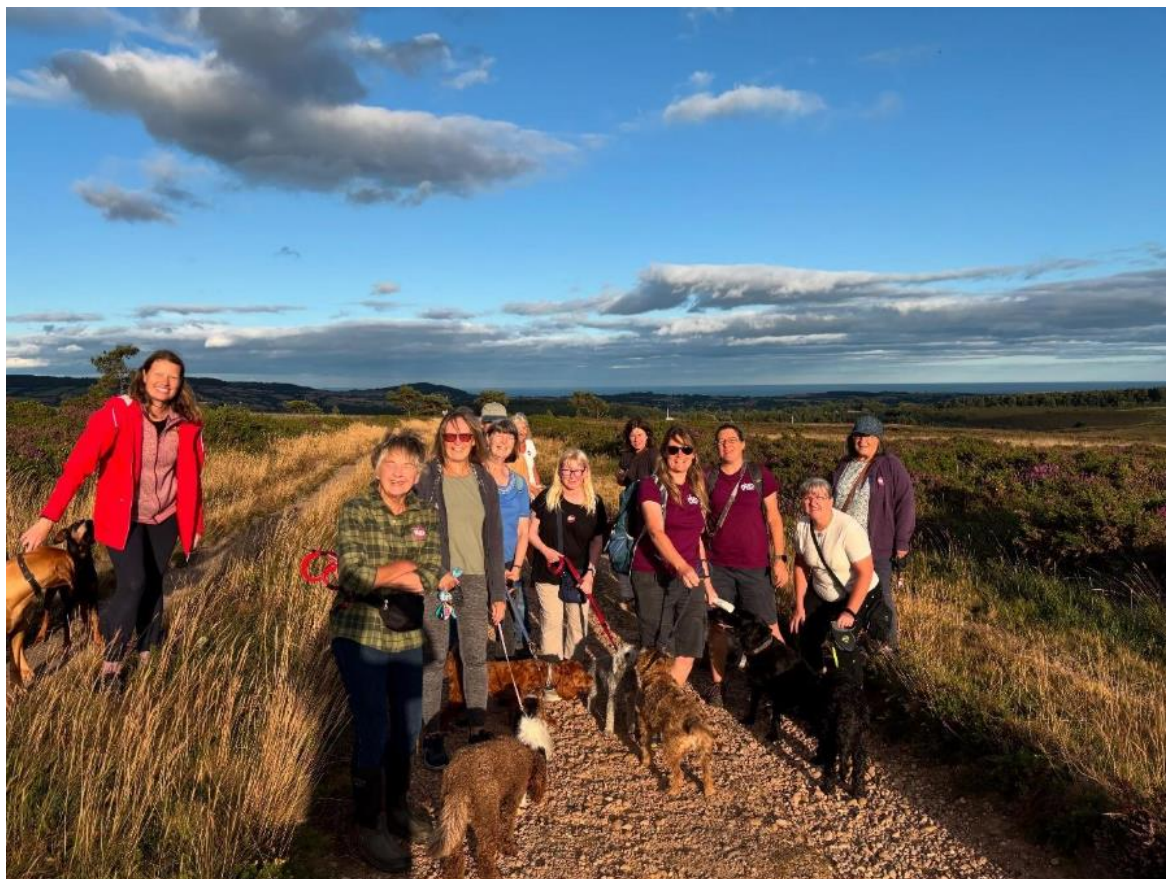
Figure 11: Waggy Walk during Heath Week to celebrate DLD's 8 th birthday.

4.4 I've attended several events over the summer including Heath Week Festival Day where I teamed up with Dawn Spence from "Pawsitive Canine" to chat to people about Canicross. I spent a busy day making dog themed crafts at Bystock Discovery Day, both as part of Heath Week.